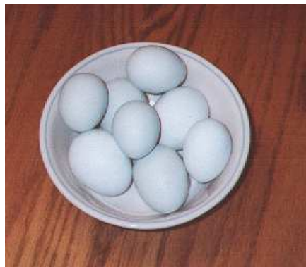
Ameraucana Eggs – Assorted sizes

For more information please refer to our website: www.ameraucana.org