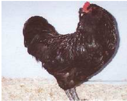
Black Large Fowl Cockerel