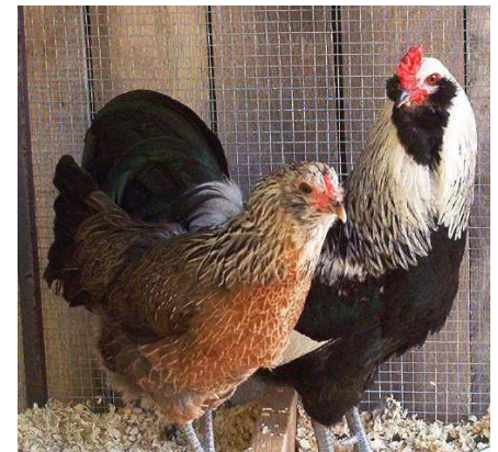
Silver Large Fowl Pair