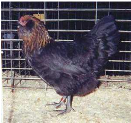
Brown Red Large Fowl Pullet

The information and pictures contained herein are not to be altered or changed without the express written consent of the Ameraucana Breeders Club. Rev. 11/06