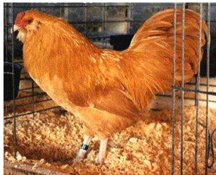
Buff Bantam Cockerel